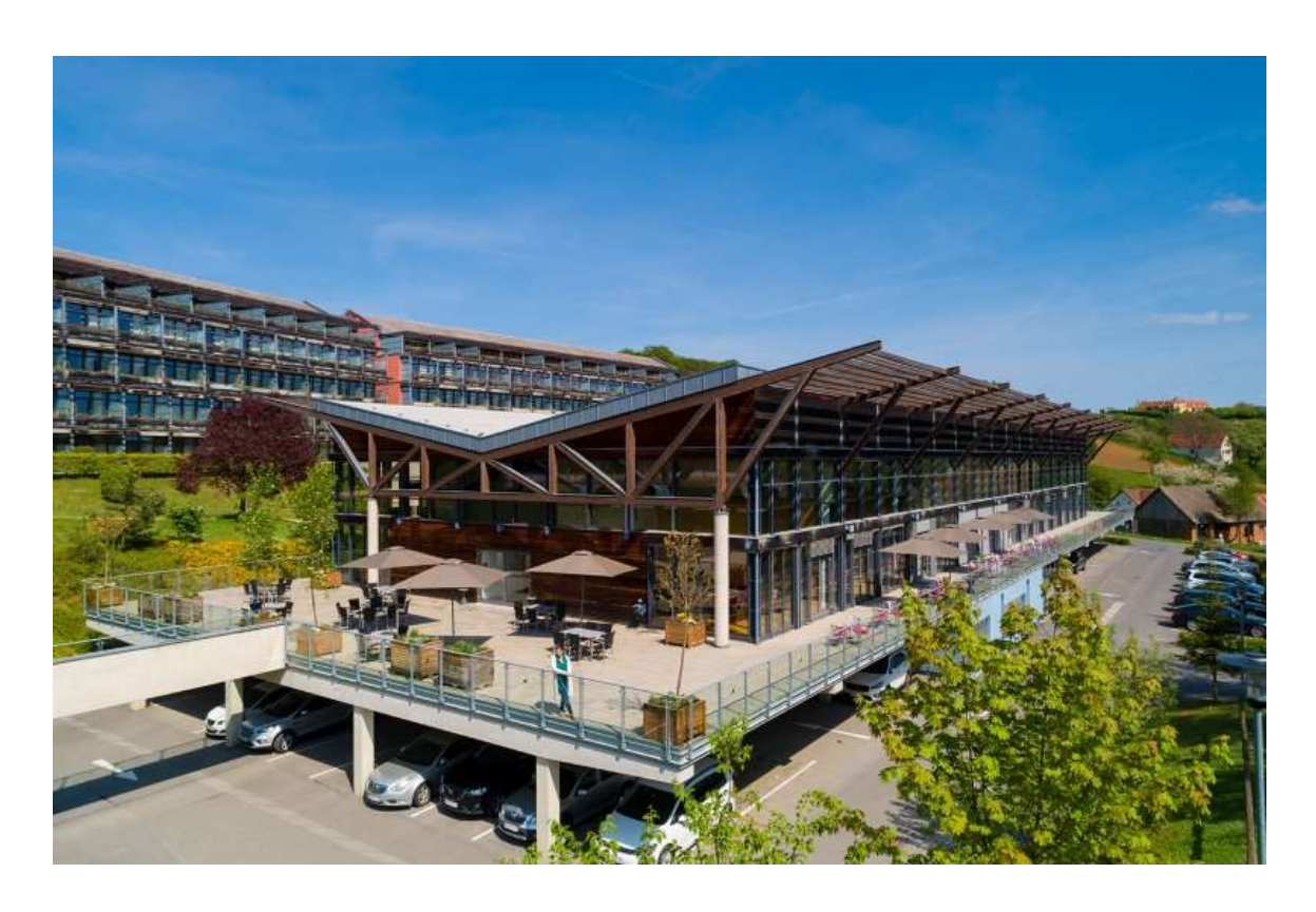
Congress Loipersdorf, Schaffelbadstraße 220, 8282 Bad Loipersdorf (Finals, medal bouts)